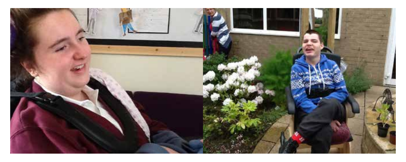
Our central courtyard, Emma's Garden, gives us a quiet sensory area to enjoy the scents of the flowers growing, watch the birds feeding and listen to the fountain flowing.